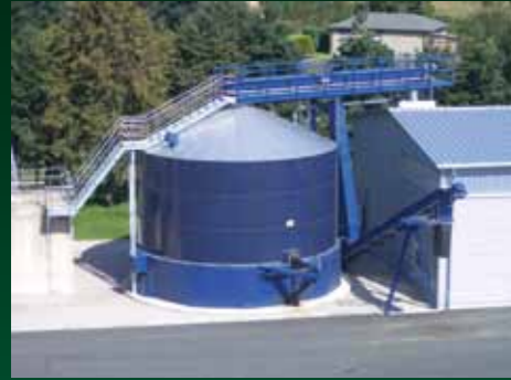
Sewage treatment works Herford, 250 cbm sludge silo in enamel execution, charged by spiral conveyor system, truck loading capacity appr. 50 to/h

Huning Maschinenbau, a company of the Huning group, supplies individual concept solutions and their execution in the area of handling, landfill and intermediate storage of sewage sludge, biomass and slow-flowing bulk materials.