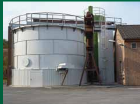
Sewage treatment works Rollsdorf, 250 cbm sludge silo in painted execution, truck loading capacity appr. 50 to/h