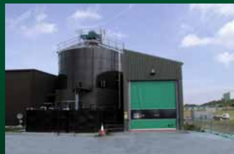
Sewage treatment works Newcastle, 500 cbm sludge silo in enamel execution, truck loading capacity appr. 120 to/h, positioned near closed loading hall.