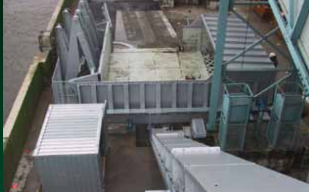
Hamburg incineration plant, overfloor reception unit for external dewatered sewage treatment works sludge.