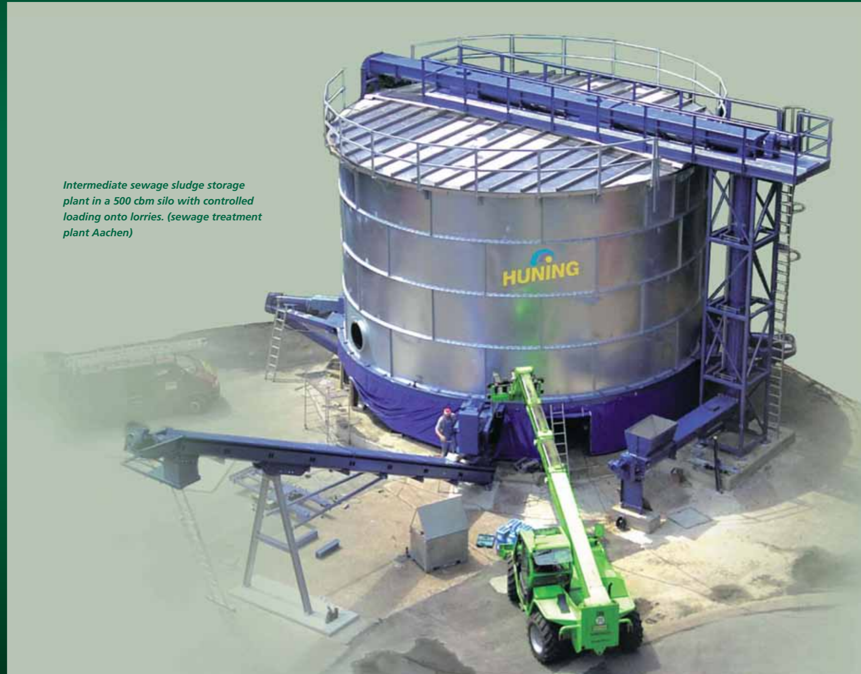
Intermediate sewage sludge storage plant in a 500 cbm silo with controlled loading onto lorries. (sewage treatment plant Aachen)

We plan, design, manufacture, deliver and install.