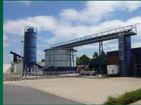
Sewage treatment works Spenge, 250 cbm sludge silo in galvanized execution, charged by spiral conveyor system, truck loading capacity appr. 50 to/h