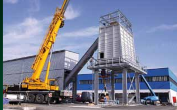
Munich, special silo design for out of date bakery products with bottom drag chain discharge, charged by inclined chain conveyor.