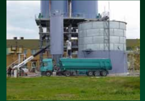
Sewage treatment works Dresden, 500 cbm sludge silo, truck loading with optional lime conditioning

We plan, design, manufacture, deliver and install.