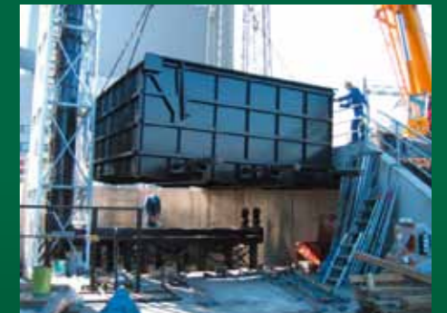
Power plant Ibbenbüren, preinstalled external sludge reception unit complete with spiral conveyor technology, modular design.