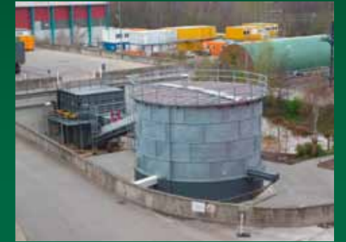
Waste incineration plant Bremen, reception unit for external dewatered sludge into 500 cbm buffer silo. Direct charge with spiral conveyor technology appr. 50 to/h.