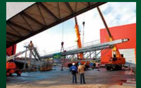
Preinstalled spiral conveyor with support steel works and walkways, free span appr. 30 m.