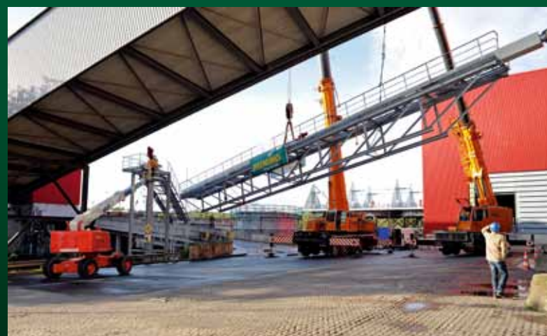
Pre-assembled conveyor line Bremen