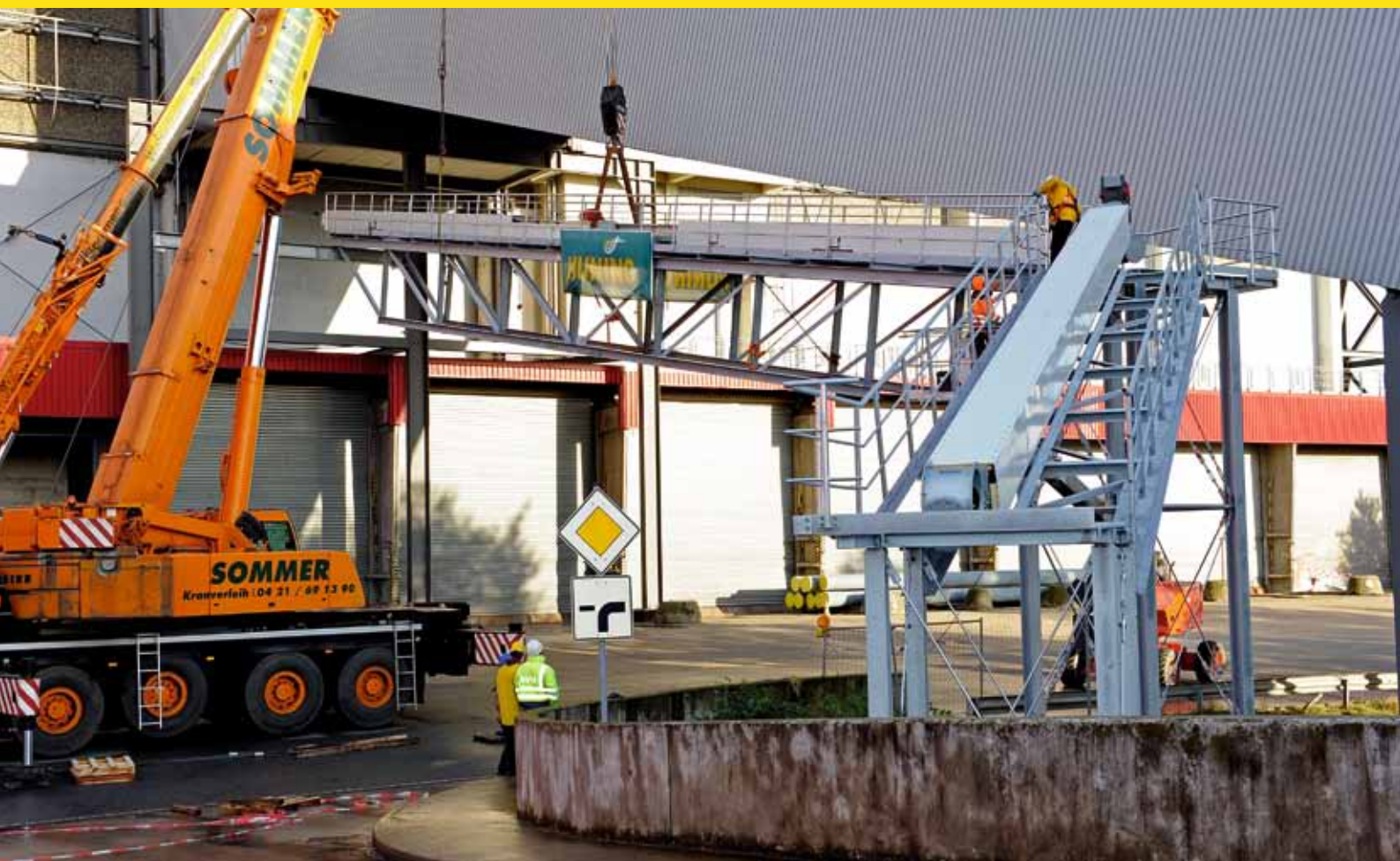
Conveyor line waste incineration plant Bremen

e.g. conveying of dewatered sewage sludge