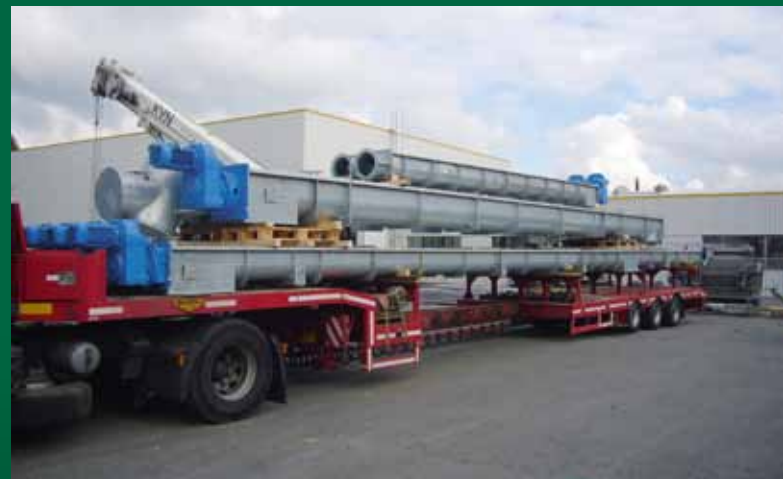
Conveyor line sludge project Moskau