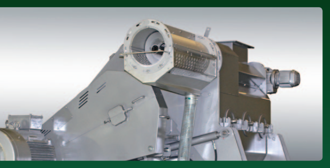
Spiral conveyor for discharge of packaging material