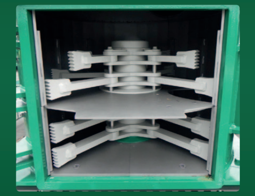
HPZ 900 rotor with patented intermediate floor.

The Impact Crusher HPZ 900 is used to crush organic wastes and high-wear substrates with a high mineral content. Depending on the overall process, it can be operated both for individual batches or continually. The central rotor is oriented vertically and is powered by a low-noise belt drive. The work space is equipped with exchangeable wear plates. Depending on the assignment, the patented intermediate floor can be fitted to bring about a longer loading time and therefore to increase the breaking up of material.