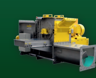
Optimatic Hammer Mill