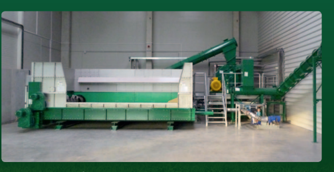
HTZ with overfloor collection and spiral conveyor